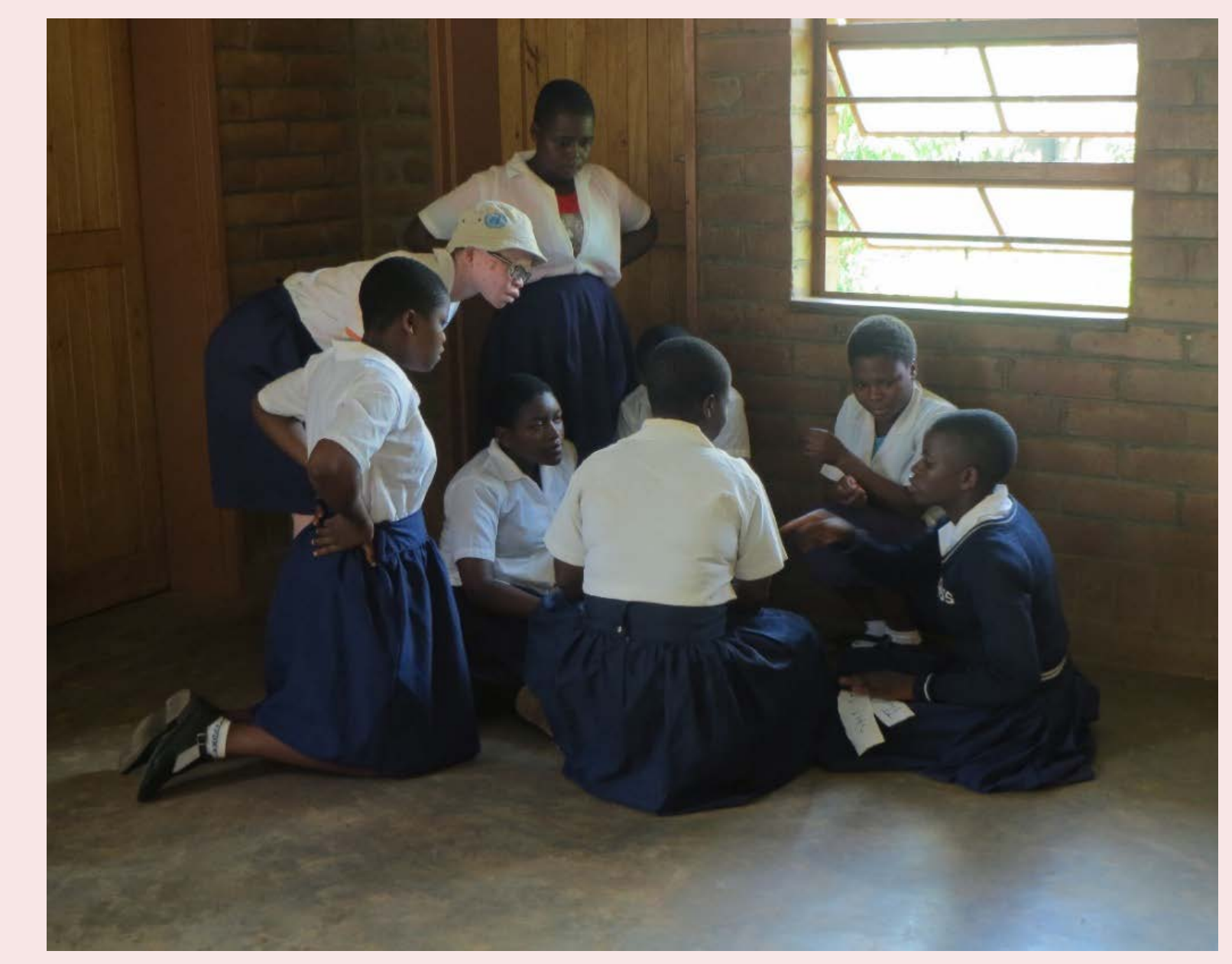
Mawa Girls huddle to figure out how to complete a program exercise

"Mawa" means tomorrow in Malawi's local language, Chichewa