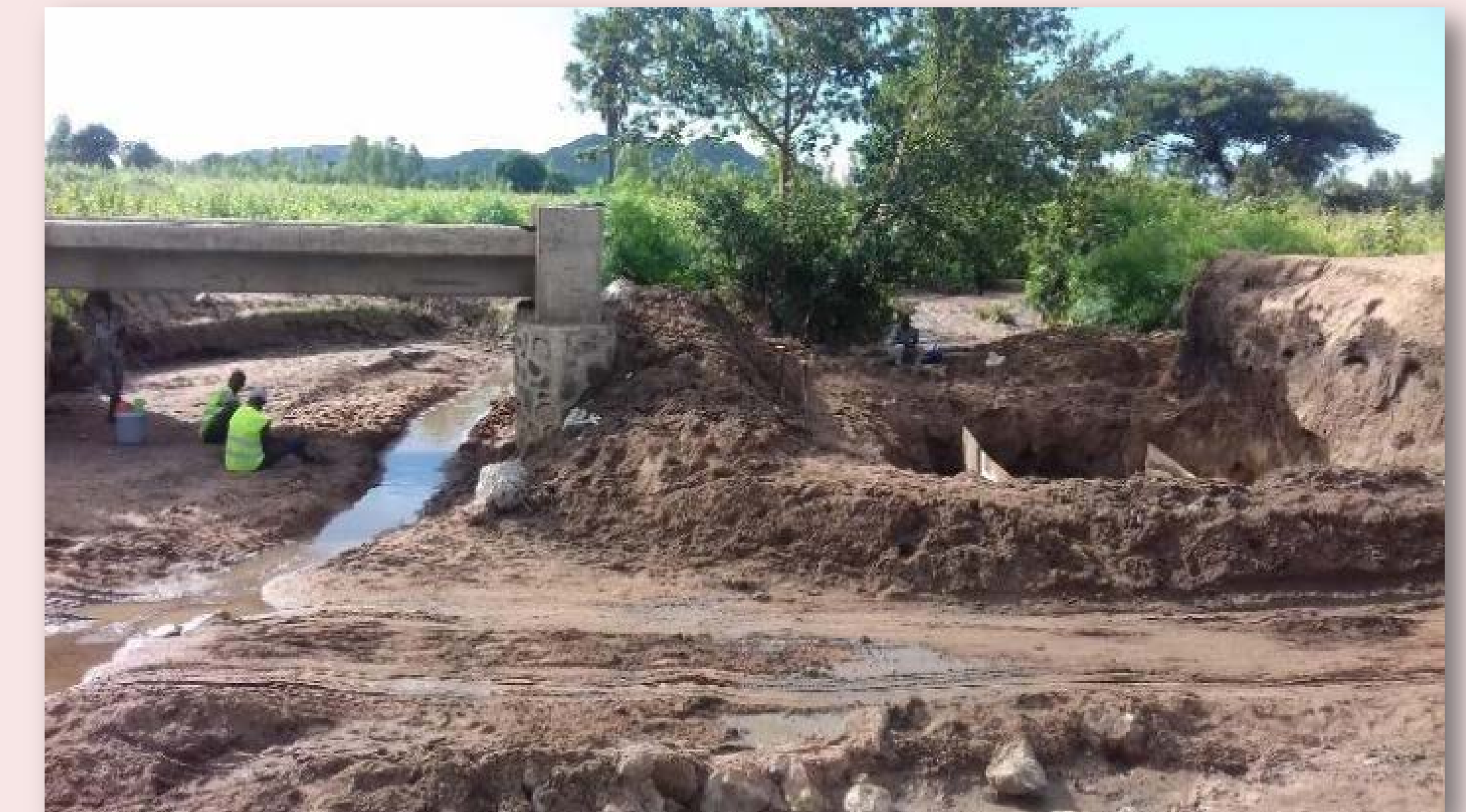
Destruction of roads and bridges made access to and provision of care in remote areas challenging