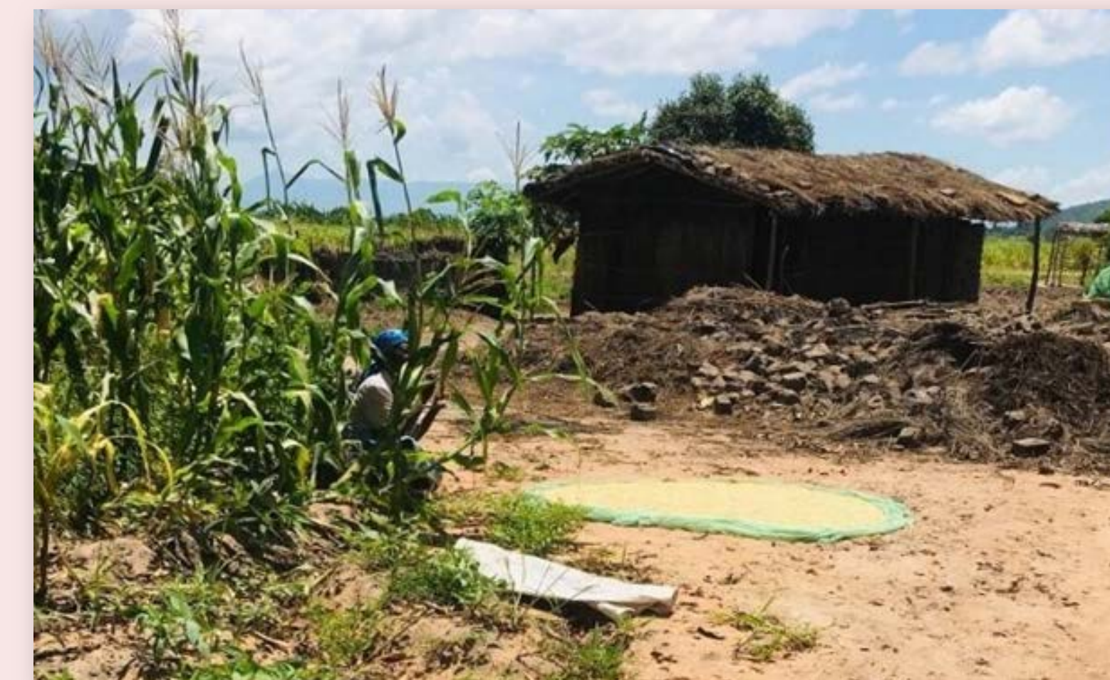
An elderly man, paralyzed in both legs and suffering from hypertension, lost his home in the flood. Due to his condition, he was not able to get to a displacement camp. Members of the village quickly banded together to build him a new, grass-thatched home on the site of the home that was destroyed. The GAIA mobile clinic visited him to assess his health and provide him his needed medications.