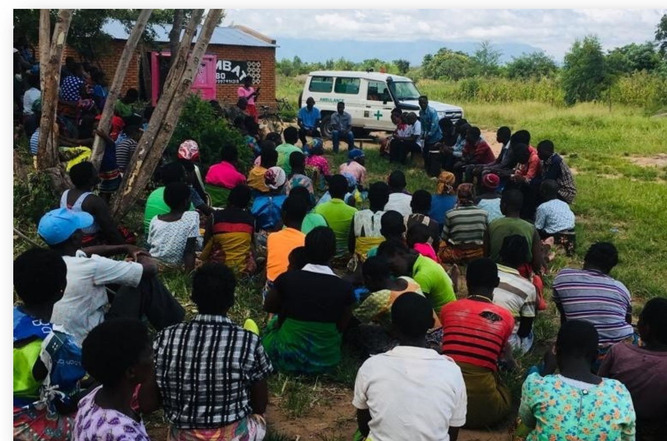
Families gathered at displacement camp to be assessed by GAIA mobile health clinics. The assessment revealed that people needed new health passports, treatment for malaria, safe water and bed nets.