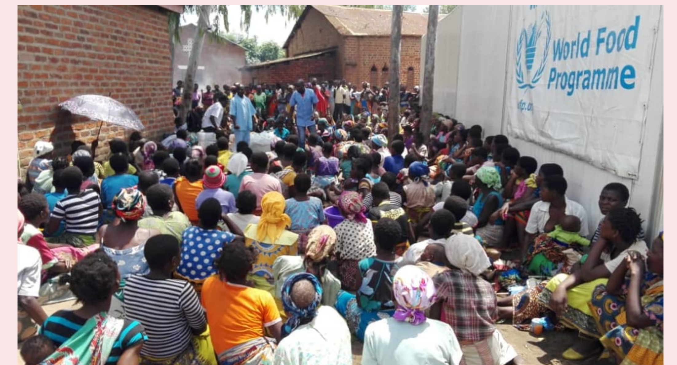
Residents of the displacements camps being triaged and organized for health care assessment

GAIA's mobile clinic model enabled a quick response to the floods and concomitant urgent medical needs; the Phalombe DHO's commitment to support mobile clinics allowed for continuity of care for both acute and chronic conditions especially HIV, and helped avoid an outbreak of cholera. Flexible mobile outreach clinics nimbly provide quality, efficient, cost-effective care in a high-HIV burden district. They provide a model for how to ensure continued care for populations at risk of climate crisis in geographies with limited resources for healthcare.